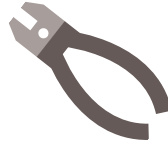
FIND THREE TOOLS