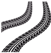
TRUCK OR TRACTOR TRACKS