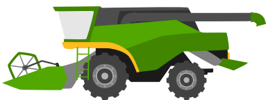
A BIG PIECE OF FARM EQUIPMENT